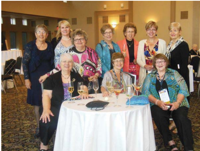
Bottom picture is of Illinois Legacy Circle Members in New Orleans!